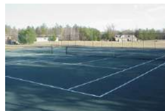
Tennis and Pickleball

WCRC's recreation facilities are free for all of our guests. We have tennis, pickleball, softball, disc golf, volleyball, playgrounds, swimming (summer only), basketball, open fields for games, horseshoes, gaga ball and hiking trails.