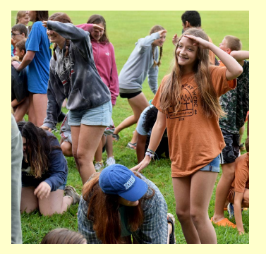
Fun Games at Camp