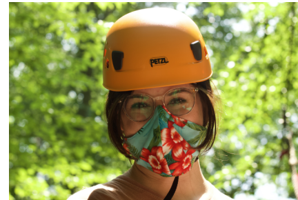
Zip Line: COVID-Style

Summer Camp 2021: After doing temperature checks and wearing masks and delivering boxed lunches to the campers in 2020, we were ready again to do whatever we could to make camp happen. When we got approval from the Health Department, we shifted to overnight cohort camp. Campers stayed in their cabin groups and did not interact in larger groups for worship, activities or dining. We held worship outdoors in Edgewood Pavilion, and we ate in a wooded area near the dining room where we carved out areas for picnic tables and named it, "The Grove." Again, we had no COVID cases among staff or campers.