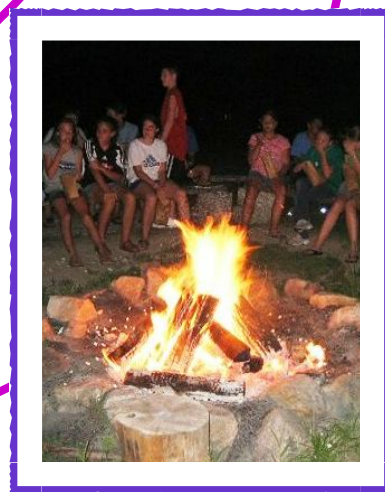
Popcorn Bonfire And More!