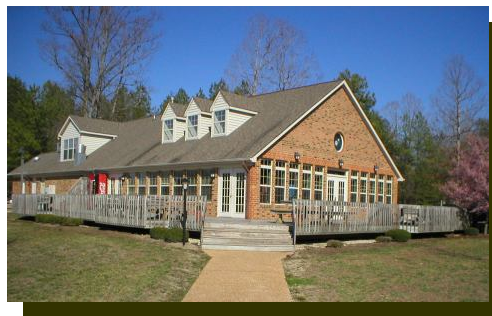
Magnolia Dining Room

Oak wood Lodge Hotel style rooms with a queen bed and two twin beds (one is a trundle bed). Private baths, linens and towels provided.