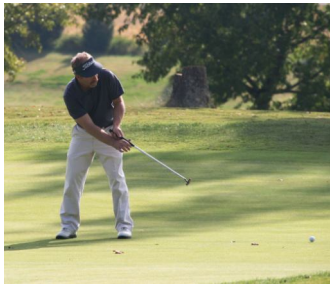
Annual Golf Classic