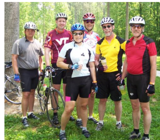
Pedal the Peninsula

For more information and to give online, click the link below