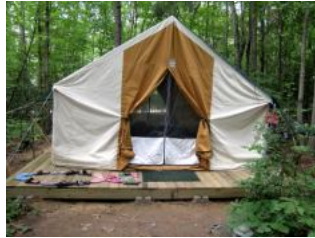
Cabin Tents for "Wilderness"